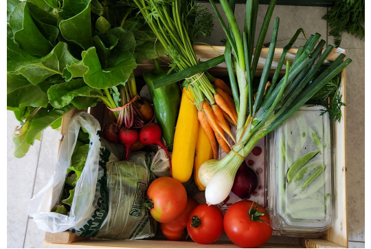
(Medium Basket 2023 season)